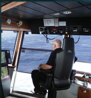
Bruce | Skipper Southern Ocean Fleet HEARD & MCDONALD ISLANDS